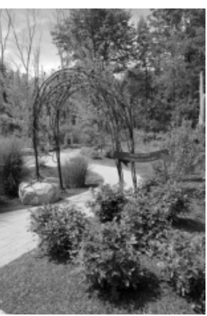
Kranz Celebration Garden

2005 Rescue Village builds the barn — since finishing we have housed horses, goats, pigs, chickens, llamas, ducks and so much more! Rescue Village seizes 113 cats from a cat hoarder.