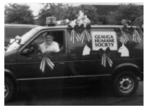
First Rescue Van

1989 GHS begins education classes on pet care.